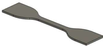
XY plane – flat orientation